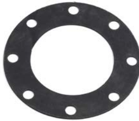
Blower/Cyclone Full Face Gasket, 150#

18" OD, 13" ID - VA38010031 18-3/4" OD, 14" ID - VA38010230 19" OD, 13" ID - VA38010247