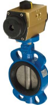
Air-Operated Butterfly Valves 4" Assembly - VA33150008 4" Actuator - VA33150008A 6" Assembly - VA33150002 6" Actuator - VA0000S4981 8" Assembly - VA33150005