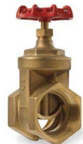
Kitz Gate Valves 3" - VA33140003