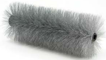
Wire Transfer Broom VA2093-0011B