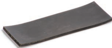
Clean Out Door Gasket VA4302-0073A