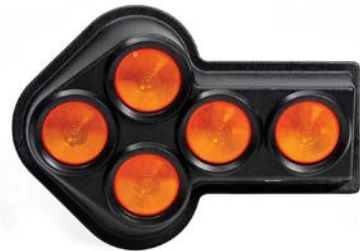
Arrow Light Board Left Hand Board - VA35030080 Right Hand Board - VA35030081 Complete Board, 36" X 72" - VA35030143