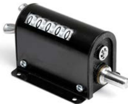
Hose Reel Footage Counter Left Hand - VA36010017 Right Hand - VA36010023 Metric - VA36010040