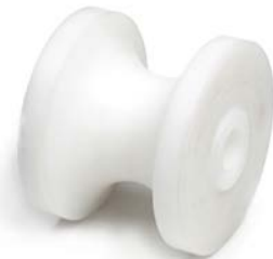
Standard Level Wind Roller VA37020076