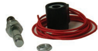
Gutter Broom Solenoid Valve Complete Valve - VA3910-0125B Coil - VA9130-0022A Seal Kit - VA603405