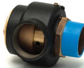
Kunkle Valve 3" Preset to 16" Hg Complete Valve - VA30020007 Nipple, 3" - 88701011