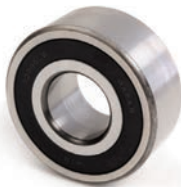
Transfluid Coupler Bearing VA604929