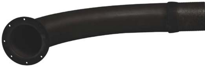
AllJetVac/AllExcavate Combo Boom Elbow, 8" VA70020538