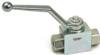
2-Way High Pressure Ball Valves 1/4" - VA31170005 3/8" - VA31170009 1/2", 7250 PSI - VA31170002 3/4" - VA31170010 1" - VA31170003 1-1/4" Hycon - VA31170011 1-1/2" - 2130530016 2" - 2130530012 2" Hycon - VA31170013 Handle Only - VA31170011A