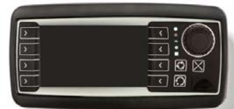
CAN Bus Control System Digital Display

10 Second - VA35050082 180 Second - VA35050085