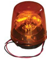
Rotating Beacon Light VA38759