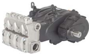
General MW Series Water Pump *Contact Vacall Parts Department

MW Series Water Pump Tool Kit - VA0000S5422 (includes items listed below):