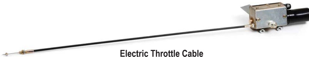
Electric Throttle Cable

Toggle Cover - VA35050003 Carling - 80263089 SPDT On-F-N - VA35050047 SPDT Momentary - VA35050048 DPDT Special Lock Type - VA35050101 DPDT Momentary, 3 Position - VA35050104 DPDT, 2 Position - VA35050105 SPDT - VA35050115 SPDT Momentary, Locking - VA35050144