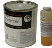
AllVac Pour-In Gasket Liquid Gasket - VA55030090A Catalyst - VA55030090B