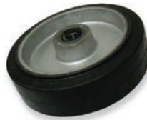
Sweeper Nozzle Wheel & Axle Assembly Assembly - VA6968-0002B Wheel - VA3968-0006 Axle - VA8047-0001B