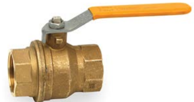
Brass Ball Valves 1/4" NP - VA33130001 1/2" 400 WOG - VA33130002 3/4" 400 WOG - VA2910-0013A 1" 400 WOG - VA33130004 1-1/4" 400 WOG - VA33130005 1-1/2" 400 WOG - VA33130006 2" 400 WOG - VA33130007 3" 400 WOG - VA33130008 4" 400 WOG - VA33130009