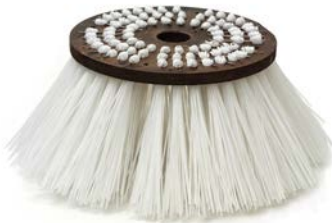
Polypropylene Gutter Broom 30" 1 Segment - VA2093-0013C 36" 3 Segment - VA0000S4695 30" Adapter - VA8009-0031C 36" Adapter - VA8009-0067C