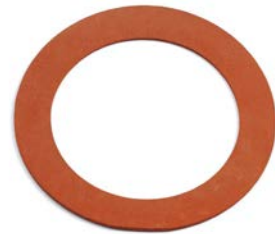
Heat Exchanger End Cover Gasket VA38010262