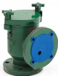
Mueller In-Line Strainer Strainer Assembly - VA39050001 Cover Plate - VA0000S4274 Screen - VA0000S4282 O-Ring - VA0000S4300