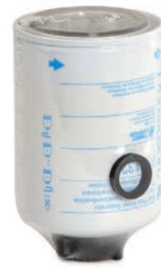
Fuel Water Separator VA2260-0030A