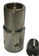
Piston Oil Seal Insertion Tool