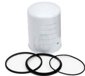
Hydraulic Filters Suction, Short, (AllJetVac) - VA31160014 Suction, Long, (AllJetVac) - VA31160014A Return, (AllJetVac) - VA31160015 Suction, (AllVac) - VA31160016 High Pressure, 10 Micron - VA2260-0010A (Sweepers and Catch Basins)