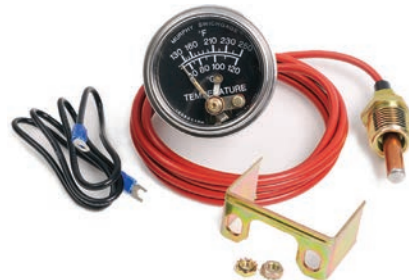
Sweeper/Catch Basin Water Temperature Gauge & Switch