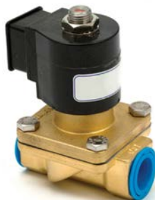
Skinner Valves Normally Opened - VA30040002 Normally Closed - VA30040021