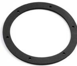
AllVac Bolt-On Dumpchute Gasket VA38010246