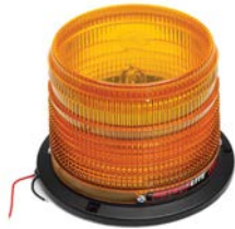
Strobe Light Standard - VA35030040 Optional 95 FPM - VA35030010