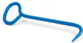
Manhole Hook VA34240010