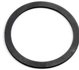
Open Cell Boom Gasket, 1/2" VA38010267

11-3/4" OD, 8-11/16" ID X 1" - VA38010087 11-3/4" OD, 8-11/16" ID X 1/4" - VA38010216