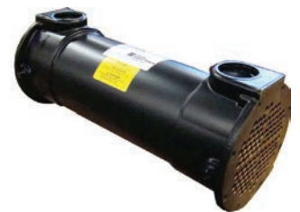
Heat Exchanger VA34240335