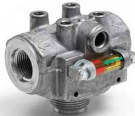
Charge Pump Filter Head VA31160019