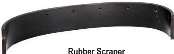
Rubber Scraper For 42" Nozzle Assembly - VA4804-0004B For 48" Nozzle Assembly - VA4804-0012B For AS/AC Units Only - 1130360012 For AS/C Super Sweep Units Only - 1130360001