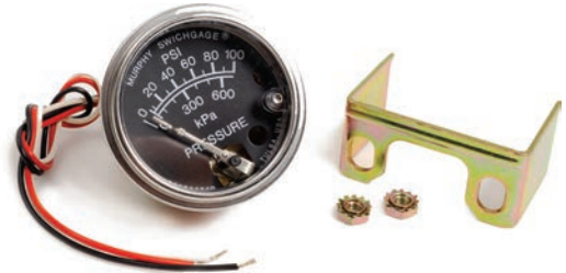
Sweeper/Catch Basin Oil Pressure Gauge

0 thru 3000 PSI, 2-1/2" Bottom - VA36010034 0 thru 3000 PSI, 1-1/2" U-Clamp - VA36010035 0 thru 30 PSI, 2-1/2" - VA36010036 0 thru 100 PSI - VA36010042 0 thru 1000 PSI, 2-1/2" - VA36010043