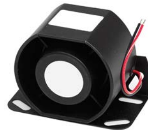
Standard Back-Up Round Style Alarm 91403420