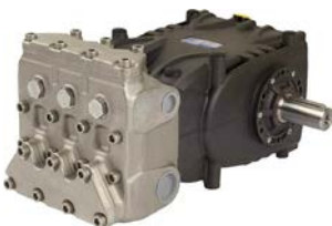
General KF28A Water Pump VA39010086

KF28A Series Water Pump Tool Kit - VA0000S5424 (includes items listed below):