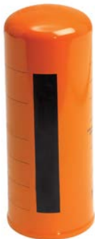
Charge Pump Filter VA31160020