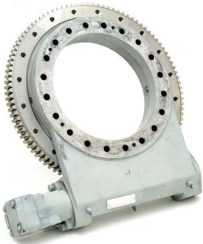
Boom Rotation Bearing w/Hydraulic Motor Assembly - VA37020005 Motor - VA0000S4435