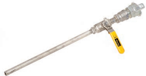
Sweeper/Catch Basin Wash-Down Hand Gun Nozzle - VA6635-0050A 3/4" X 25' Hose - VA6387-0072A