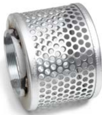
Strainers 2" Basket - VA39060011A 4" Basket - VA39060021A 6" Basket - VA39060018A