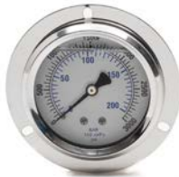
AllVac/AllJetVac/AllExcavate Vacuum Gauge

0 thru 3000 PSI, 2-1/2" Bottom - VA36010034 0 thru 3000 PSI, 1-1/2" U-Clamp - VA36010035 0 thru 30 PSI, 2-1/2" - VA36010036 0 thru 100 PSI - VA36010042 0 thru 1000 PSI, 2-1/2" - VA36010043