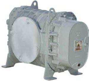
Roots 824 RCS-V Blower VA4201002