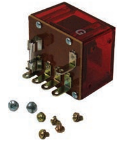
Murphey Shut Down Switch VA9848-0010

Standard Cable - VA35060003 Soft Cable - VA80030043C For Sweepers/Catch Basins - VA602264