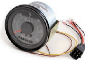
Sweeper/Catch Basin Tachometer w/Hourmeter