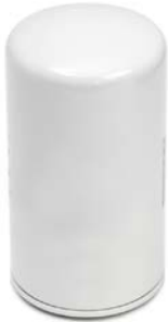
Oil Filter 80674016