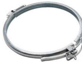
Over Center Tube Clamp