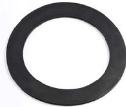
Expansion Joint Neoprene Sponge Gasket

4" - VA38010015 6" - VA38010017 8" - VA38010018 10" - VA38010019 12" - VA38010020