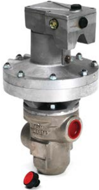
General Air Actuated Regulator 111 GPM, 3500 PSI - VA39030021 132 GPM, 2350 PSI - VA39030007