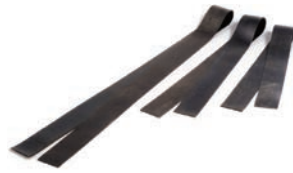
Water Tank Strap Gaskets Short Gasket - VA38010243 Long Gasket - VA38010244 Support Gasket - VA38010245