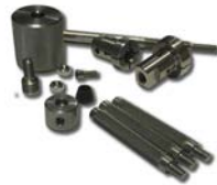
Valve Install & Removal Tools