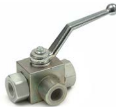
3-Way High Pressure Ball Valves 1/4" - VA31170014 3/8" - VA31170015 1/2" - 2130520026 3/4" - 2130520027 1" - 2130530007 1-1/4" - 2130530008 1-1/2" - VA31170017 Handle Only - VA31170011A