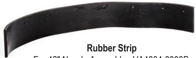
Rubber Strip For 42" Nozzle Assembly - VA4804-0003B For 48" Nozzle Assembly - VA4804-0013B