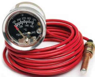
AllVac/AllJetVac/AllExcavate Water Temperature Gauge & Switch