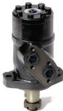
Gutter Broom Motor Motor - VA3587-0038B Seal Kit - VA9486-0186