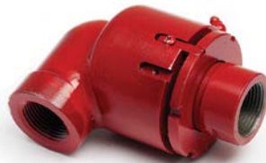
90° Hose Reel Swivel 3/4" Pipe - VA39010019 1" Pipe - VA39070001 1-1/4" Pipe - VA39070002 2" Pipe - VA39070003 1-1/2" Pipe - VA39070006