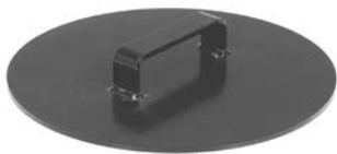
12" Porthole Cover VA8139-0009A