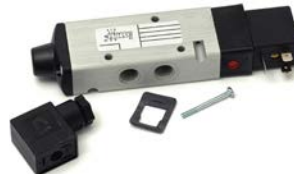
Air Solenoid Valve 1/4" Single - VA30040009 1/4" Double - VA30040005