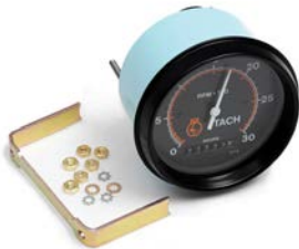
AllVac/AllJetVac/AllExcavate Tachometer w/Hourmeter

Gauge and Mounting Hardware - VA9305-0001B Sending Unit - VA602058