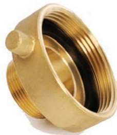
Hydrant Coupling VA2272-0004A