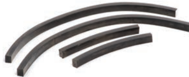
Transformation Gasket 4 Piece Gasket - VA6302-0001A Rubber Rivets - VA2779-0012A

AllJetVac/AllExcavate, 188" - VA38010203 AllVac/Round Body AllJetVac, 233" - VA38010205 Sweeper/Catch Basin - VA4832-0076A