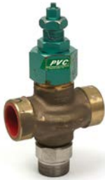
Baird Regulator, 2" 30 thru 115 GPM, 1-3K PSI - VA39010022 30 thru 115 GPM, 1-6K PSI - VA39010025 50 thru 210 GPM, 1-2K PSI - VA39030003 185 thru 250 GPM, 2-3.5K PSI - VA39010023

* Myers Regulator to General Regulator. Replacement Kit includes General Regulator 2130530014 and hardware for conversion.