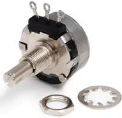
Potentiometer for Hydrostatic Drive

Potentiometer - VA35050074 Glove Knob - VA35050073