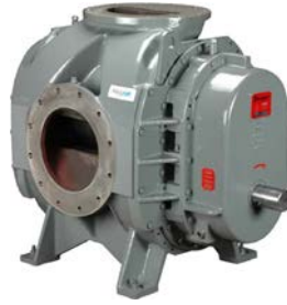
Roots 1125 Trinidad Blower VA42010040