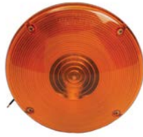
Amber Directional Light, 7" VA30626