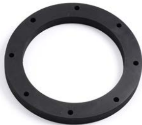
Boom Slide Tube Gasket

3" - VA38010040 4" - VA38010041 6" - VA38010042 8" - VA38010043 10" - VA38010044 12" - VA38010045 14" - VA38010046 16" - VA38010083