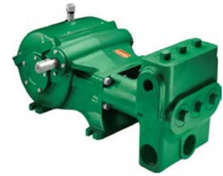
Myers DP85-20 Water Pump VA39010087

MW Series Water Pump Tool Kit - VA0000S5422 (includes items listed below):