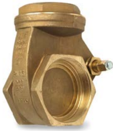
Slam Type Gate Valves 4" w/Lever - VA33140018 6" w/Lever - VA33140010