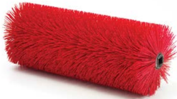
Polypropylene Transfer Broom VA2093-0012B