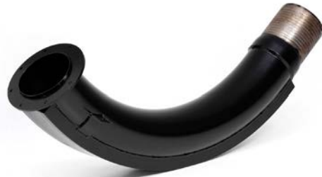
AllJetVac/AllExcavate Heavy Duty Combo Boom Elbow, 8" VA70020562