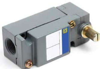
Debris High Level Switch VA35050100

w/Out Stop Ball - 2230180017 w/Stop Ball - 2230200004