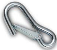
Safety Hooks w/Pin Out - VA34050002 w/Pin - VA602731 Carbon Steel - VA2385-0002A