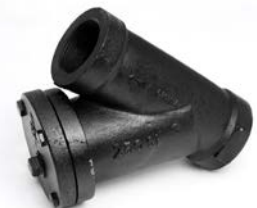
Y-Strainers 1-1/2" - VA3845-0001A 2-1/2" - VA33210002 2-1/2" Stainless Steel - VA39050007 2-1/2" Screen - VA0000S5133