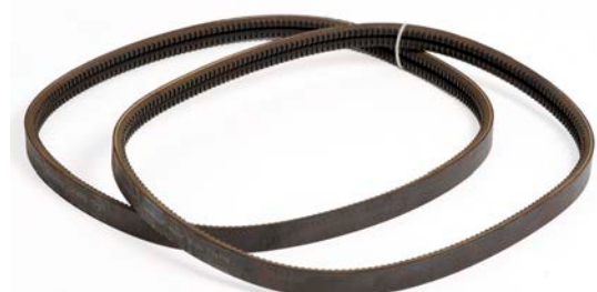
Blower Drive Belt Set (Sweepers and Catch Basins) 2 Belt Set - VA2064-0054A 4 Belt Set - VA2064-0035A