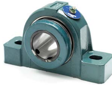
Pillow Block Bearings For Blower Drive - VA2062-0023B (Shaft - VA4820-0100) For Transfer Broom - VA2063-0010A (Shaft - VA8820-0027A) For Hose Reel - VA37020012 (Consult factory for axle) For Hose Reel - VA37020111 (Consult factory for axle)