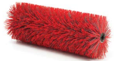
Wire & Polypropylene Transfer Broom VA2093-0010B