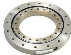
Hose Reel Rotation Bearing VA37020131