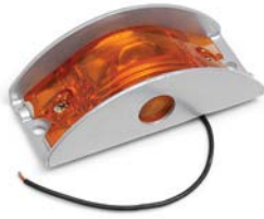
Marker Light Amber - VA16131 Red - VA16132