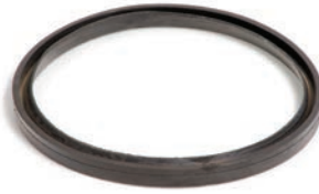
Aluminum Extension Tube Gaskets (Flatback)

4" - VA38010097 6" - VA38010099 8" - VA38010100 10" - VA38010101 12" - VA38010102