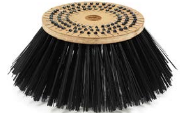
Wire Gutter Broom 30" 1 Segment - VA2093-0002C 36" 3 Segment - VA2093-0016C 30" Adapter - VA8009-0031C 36" Adapter - VA8009-0067C