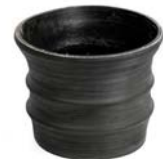
AllJetVac/AllExcavate Disconnect Boot Standard - VA38020001 Mini - VA38020010