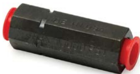
Hycon Check Valve 88662994