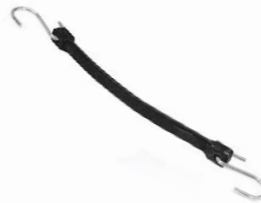
Bungee Cords 9" - VA34230007 12" - VA34230003 15" - VA34230005 20" - VA34230004