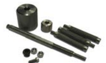
Packing Removal Slide Hammer