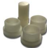
Packing Insertion Kit