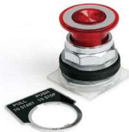
Push/Pull Emergency Stop Switch VA35050134A