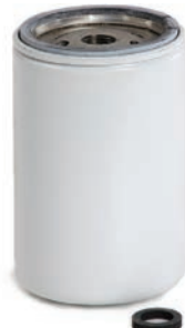
Cummins Fuel Filter 77383203