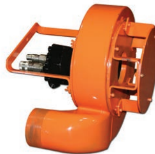
Sludge/Trash Pump 4" 750 GPM @ 10 Ft. HD. - 2130450001 Gasket - VA38020011