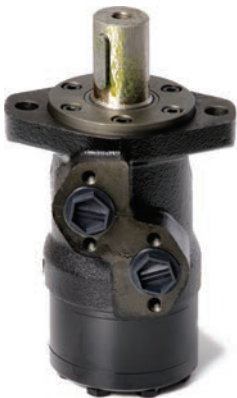
Transfer Broom Motor Motor - VA3587-0037B Seal Kit - VA9486-0186