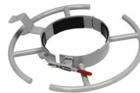
Circular Handle Assembly