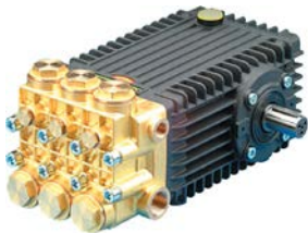
General TSF2221 Water Pump VA3747-0033B

TSF2221 Series Water Pump Tool Kit - VA0000S5423 (includes items listed below):