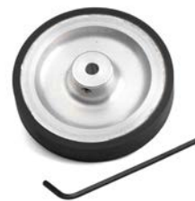
Counter Wheel VA36010010