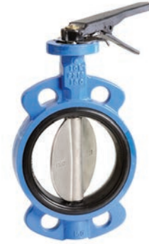
Manually Operated Butterfly Valves 4" - VA33150020 6" - VA33150001 8" - VA33150009