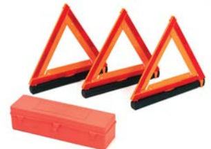
Triangle Flare Kit VA34240095