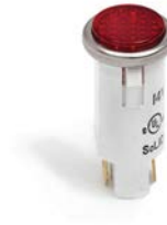
Lamp Red - VA35030052 Green - VA35030053 Amber - VA35030054