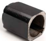
Drive Collar Coupler Weldment 1/4" Mounting Hole (Old Style) - VA8138-0022A .69" Mounting Hole (New Style) - VA8138-0023A