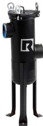
Rosedale Filter Housing VA39060025