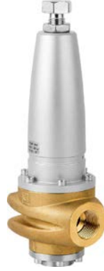
General Regulator 132 GPM, 3335 PSI 2130530014