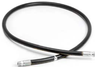
Leader Hose 1" X 10' - VA39100140 1" X 20' - VA39100141