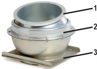
"Old Style" Clamp On Intake Hose Ball Joint Assembly