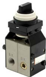
SMC Air Shifter Switch VA30020022