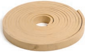
Sweeper/Catch Basin Tailgate Gasket VA4832-0076A