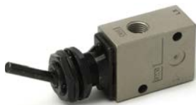
Hose Reel Brake Switch VA30020004