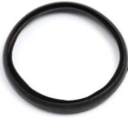
Steel Extension Tube Gaskets (Roundback)

4" - VA38010097 6" - VA38010099 8" - VA38010100 10" - VA38010101 12" - VA38010102